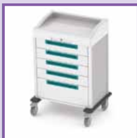
Hospital Carts & Bedside Cabinets