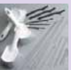
Cleaning & sterilisation