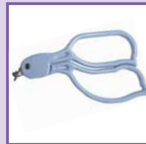
Skin Staple Remover