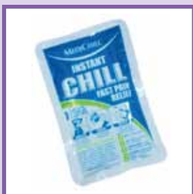
Medichill Ice Packs