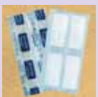
Medichill ice packs