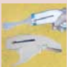
OT and general consumables