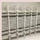
High density storage