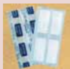
Medichill ice packs