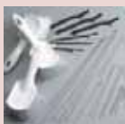
Cleaning & sterilisation