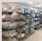
Shelving & storage